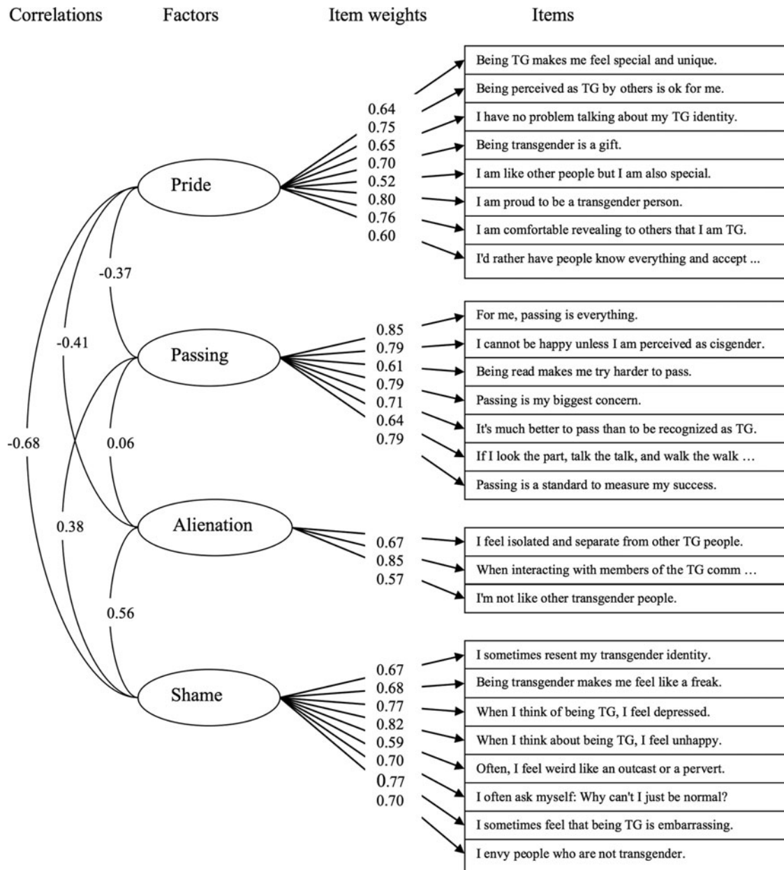
FIG. 2. Factor structure of internalized transphobia as measured by the Transgender Identity Survey ( N=903 ). The items are shortened to fit the graphic. For full items, please see Appendix A. TG, transgender.